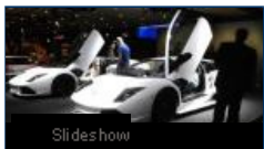
Slideshow: Gas hogs