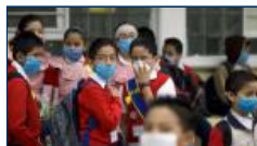
Blog: Flu, fear and family