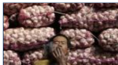
U.S. business worried China stimulus favors locals