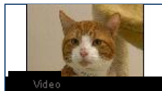
Video: Pets are abandoned due to recession