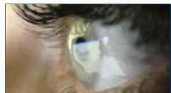
Blog: Twitter, from poor man's email to innovation